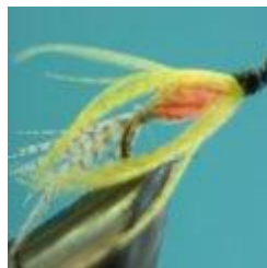
Mayfly wet, Preska Hook size 12 - 16