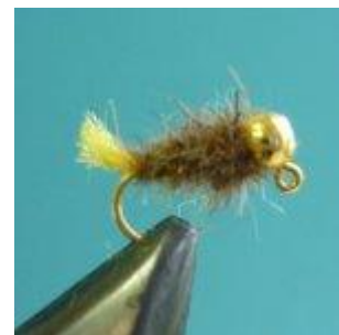
Goldnymph color brown, beige or grey Hook size 16 - 20