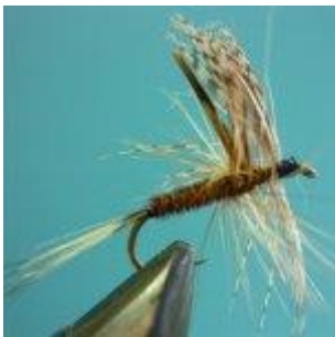
March Brown dry Hook size 12 - 16