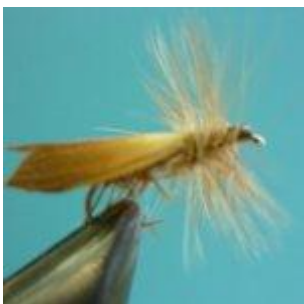
Sedge fly dry tan Hook size 12 - 16