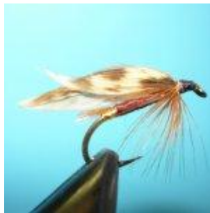
March Brown wet Hook size 10 - 14