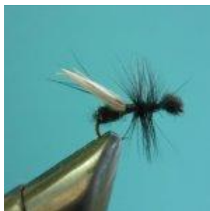
Ant dry black and red Hook size 16 - 20