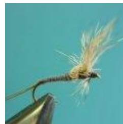
Caddis fly dry Hook size 14 - 18