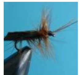
Sedge fly dry Hook size 14 - 18