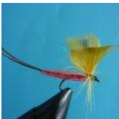
Mayfly dry, color yellow and orange, Hook size 10 - 14